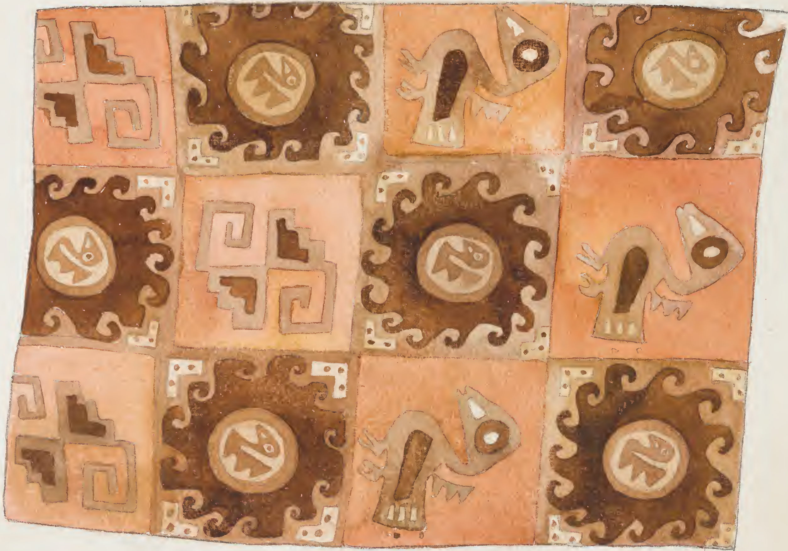
Piece of cloth from Prehistoric Peru. Design painted on cloth.